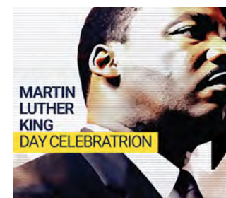
Martin Luther King Day Celebration