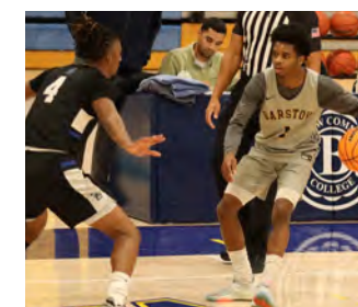
Men's Basketball Schedule