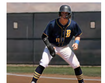
Men's Baseball Schedule