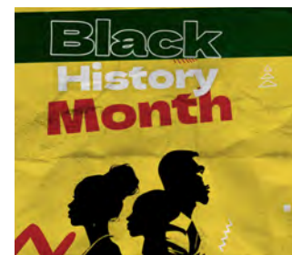
Black History Month Events